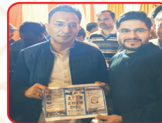
Jitin Prasad, Minister of State, Government of India